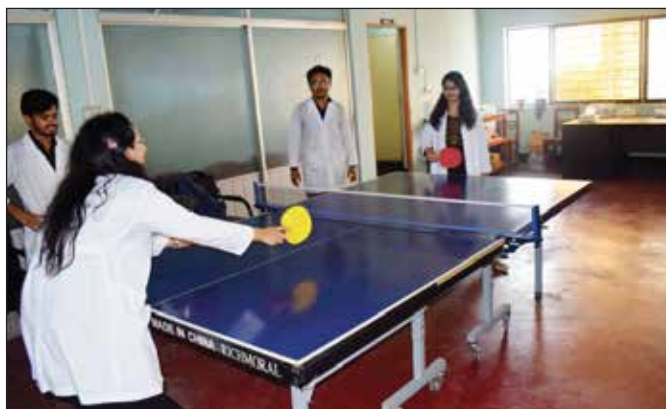
TMSS Medical College held student week 25-31 May' 2022 as part of co-curricular activities.