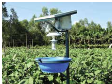
Use of contemporary solar powered light trap technology in crop fields

According to TMSS, if pheromones can kill fully formed insects by drawing them in, then many different types of crops can be cultivated by lightly misting plants every few days or even be-