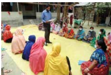
Courtyard training for knowledge sharing and skill development for rural women

The International Food Policy Research Institute (IFPRI) has conducted this study at the request of the Ministry of Women and Children Affairs (MOWCA) and the World Food Program (WFP) in