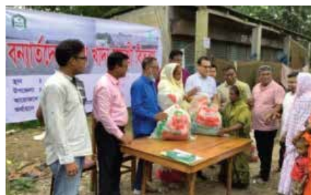
TMSS Executive Director delivering humanitarian aid materials to the flood victims in Sylhet