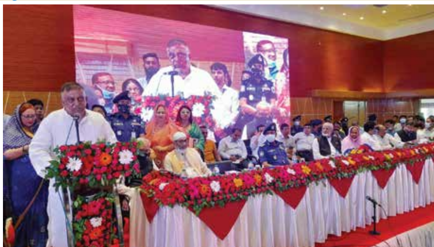
The heroic freedom fighter Asaduzzaman Khan MP, the Home Minister of the Government of Bangladesh delivered the key-note speech at a TMSS organized event in Bogura

On July 19, 2022, in Bogura, the valiant freedom fighter Asaduzzaman Khan MP, the Home Minister of the Government of Bangladesh, visited TMSS, one of the top non-governmental development organizations in the nation. The Home Minister highlighted the importance of women's develop-