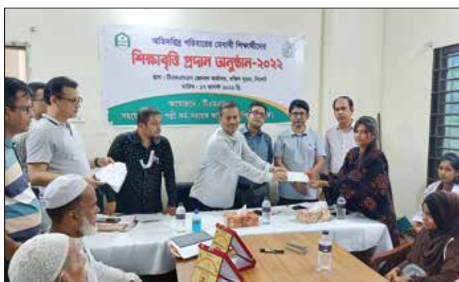
Students receiving scholarship cheques from high official of PKSF and TMSS at the TMSS HEM Grand Sector's South Surma branch in Sylhet