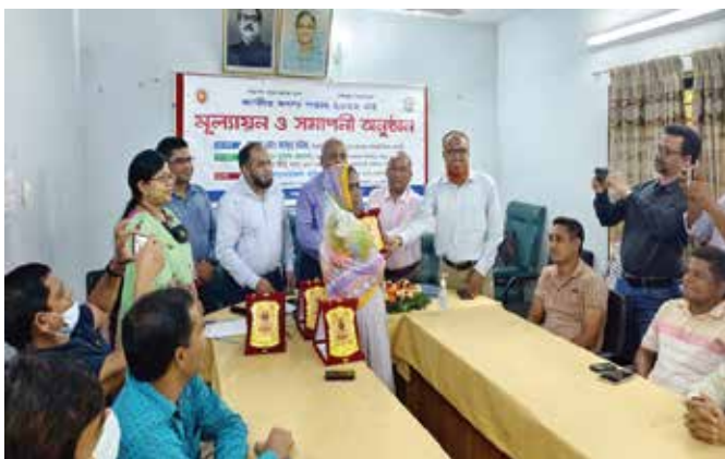
Successful female fishery entrepreneurs in Bagura received award

News Source: PRP Department, TMSS, Bogura