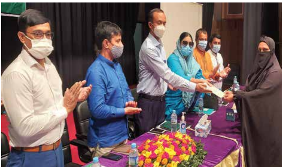
HEM new branch launching ceremony in Sherpur district

T MSS HEM (Health, Education, and Microfinance) Grand Sector has launched 33 new branches across the country to provide microfinance, microenterprise, and other well-being services through the August 2021-2022 FY. These new branches are in the districts of Bogura, Joypurhat, Jamalpur, Kurigram, Rangpur, Gaibandha, Chattogram, Comilla, Chandpur, Jessore, Kushtia, and Barishal.