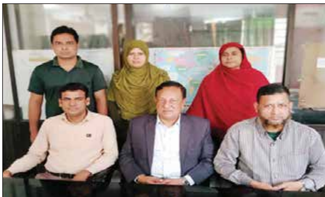
TMSS Task Force Team is working to establish institutional integrity by preventing significant crimes like corruption, inconsistency and embezzlement.