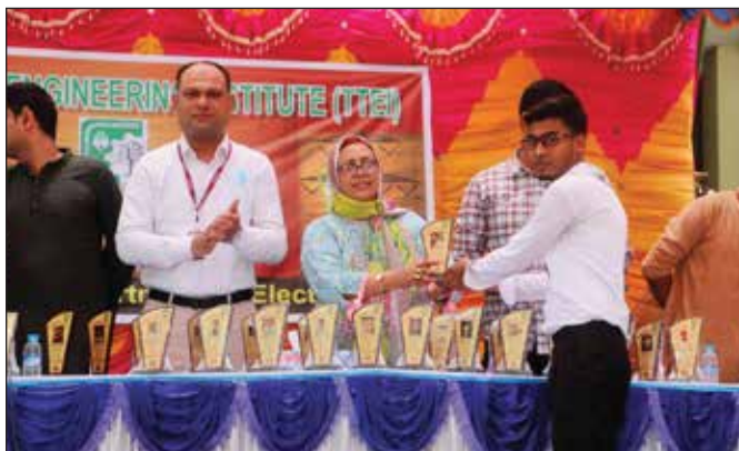
Crests are presented to students of Academic Year 2018-19 during TTE's farewell reception 2022.