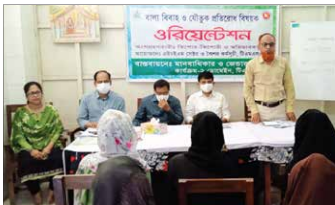
Orientation on prevention of child marriage and dowry is held at the Office of Human Rights and Gender Activities with the adolescents.