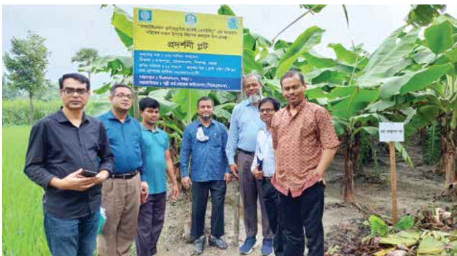
High Officials from PKSF and TMSS visited SEP-Banana at Mokamtala, Bogura

According to productivity studies, a typical banana bunch delivers 35-40 bananas, whereas the G-9 type yields 155-160 bananas per bunch. This method is also more economically profitable. Traditional banana farming produces just 60-70 thousand taka per big-ha of land. The G-9 technique, on the other hand, generates more than 140 thousand takas. Aside from that, there is an increase in demand for organic G-9 banana types in local markets and su-