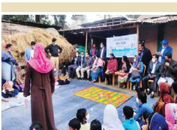
Courtyard meeting and knowledge sharing session of water credit project officials

To fulfill the project's WASH coverage goal, TMSS must reach 2,000,000 people. Through the HEM