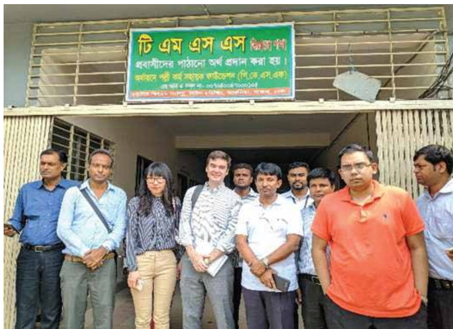
Following the successful meeting, officials from TMSS and Triodos Investment Management BV are in one frame

It's led to a lengthy and rigorous process and effective communication between TMSS and Triodos Investment Management BV. Receiving funding from Triodos Investment Management BV, a new player in Bangladesh who is in-