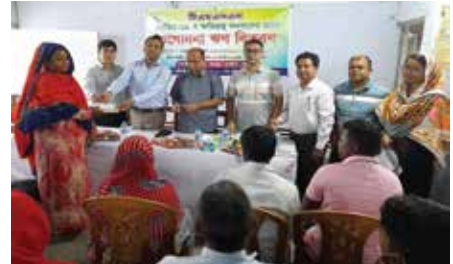
Mr. Nasim Reza, Additional Commissioner (Land), Sadar, Bogura handing over stimulus Loan Package to Covid-19 Affected Vulnerable Communities and Entrepreneurs

The government's Bangladesh Bank Refinancing Scheme (BB-RFS) is an economic stimulus program that is carefully monitored to make sure the targeted populace gains from a resurrection of their business investments and income-generating activities (IGAs).