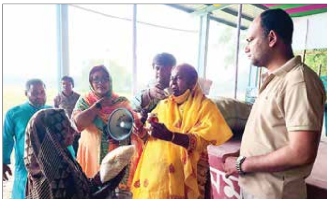
TMSS is frequently distributing pure honey of Saffola Company, donated for distribution among the malnourished Corona victims.