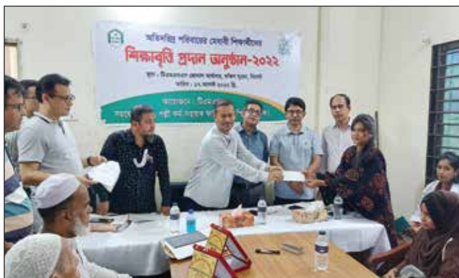
Scholarship cheques were handed over at a program organized at the TMSS HEM Grand Sector's South Surma branch in Sylhet on 17 August 2022. High official of PKSf and TMSS were present on this occasion.