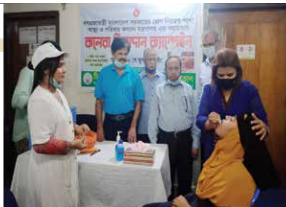
Cholera vaccine administrating to incoming patients at TMSS Masuda Maternity Hospital

T HE TMSS MASUDA MATERNITY HOSPITAL ran the "Cholera Immunization Campaign-2022" with help from the Disease Control Wing of the People's Republic of Bangladesh's Ministry of Health and Family Welfare. Senior Health Department representatives visited the immunization program, including the president of the Home Owners Association, TMSS Consultants, Deputy Executive Directors, Directors, Managing Director of TMMH, and Marketing Head (applicable to all age groups of 1 year and above).