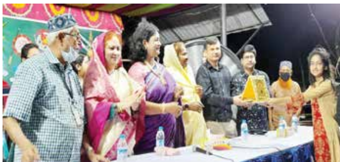
The invited guests giving awards among the winners in various competitions of the occasion

setting at that time. The fair's visitors presented prizes to the champions of several categories, including cultural competitions. This year's fair emphasized on rural culture with a range of cultural programs, including stick and leaf games. Local cuisine and toys were being sold by merchants inside the