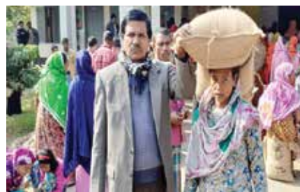
VGD program participant receiving food commodities

as development support services (including training in life skills and income-generating skills, sav-