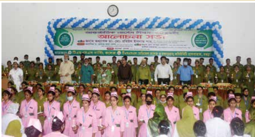
International Nurses Day 2022 celebration of TMSS Nursing College (TNC)