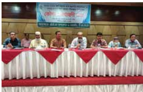
The workshop participants are delivering orientation speeches

the geographical structure and demands of members and beneficiaries.