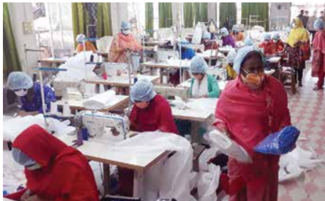
PPE Production by TMSS