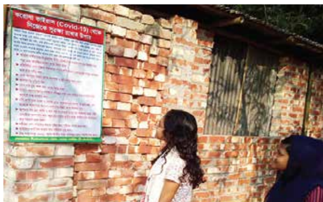
Awareness building by installing board on wall around

each of our offices and washing points have been kept effective at the gates of every office and installation. Disinfection work is going on regular basis in different roads and communities by sprinkling of bleaching powder mixed water on the advice of Civil Surgeon Bogura by trunk lorries. In April 2020 TMSS donated a percentage of their salary to the Relief Fund set up by Honourable Prime Minister. So far TMSS has distributed hand sanitizer, soap, Personal Protective Equipment (PPE) including over 2 million masks to healthcare workers, produced and supplied more than 50,000 PPE kits to the Department of Health of Bangladesh, Office of Deputy Commissioners, Bangladesh Police and Social Welfare offices etc, and has been an active organiser in the provision of awareness related to COVID-19 at grass-roots level across the country including supporting local authorities in community policing for monitoring home quarantine, isolation and social distancing rules.