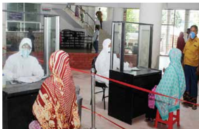
Patient examine at OPD