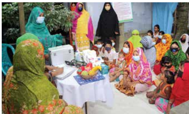
Awareness Building Campaign by THS

making a unique contribution to the country's mainstream health sector by providing treatment to corona patients. TMSS formed a Medical Mobile