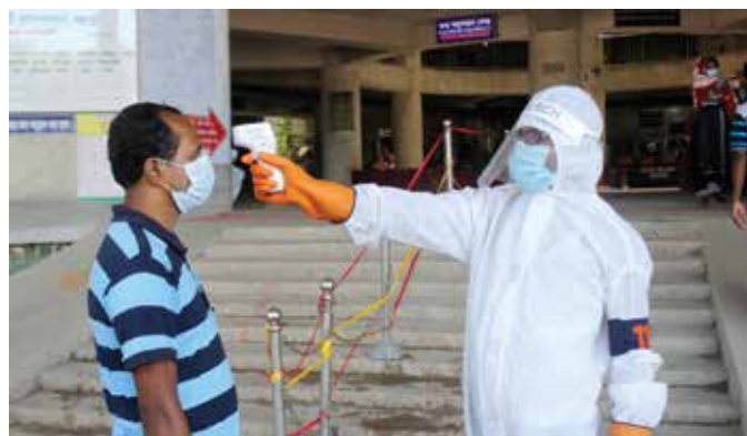
Separate Entrance & Exit of Hospital

An integrated Triage System (physical, manpower, logistics, etc.) is in action at TMC & RCH hospital to ensure separate entry & exit, separate OPD for patients with fever, cough, sore throat etc. The hospital is also demarked as green, yellow and red zone as well as COVID and Non-COVID zone with hotline service to increase access to patients. However, the other services of TMC & RCH are open for 24/7 as usual.