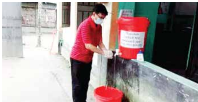
Hand wash instruments set up in Voatmari Branch, Lalmonirhat

TMSS stands by the distressed people during this COVID-19 situation with its topmost capacity. To assist more to vulnerable community of Bangladesh during Covid-19, TMSS has launched a donation box naming https://donation-tmss.org by which international elites, individuals and funding agencies can contribute to mitigate the crisis of affected people.