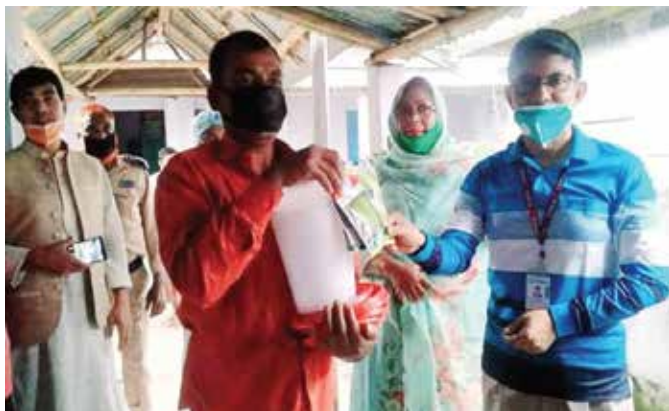
Seeds distributing activities among the farmers in Bogura