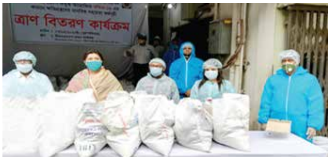
Distribution of Food packages