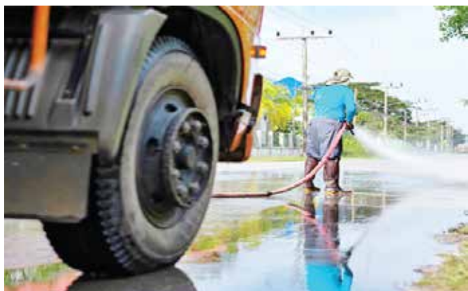
Disinfection work on roads of Bogura

each of our offices and washing points have been kept effective at the gates of every office and installation. Disinfection work is going on regular basis in different roads and communities by sprinkling of bleaching powder mixed water on the advice of Civil Surgeon Bogura by trunk lorries. In April 2020 TMSS donated a percentage of their salary to the Relief Fund set up by Honourable Prime Minister. So far TMSS has distributed hand sanitizer, soap, Personal Protective Equipment (PPE) including over 2 million masks to healthcare workers, produced and supplied more than 50,000 PPE kits to the Department of Health of Bangladesh, Office of Deputy Commissioners, Bangladesh Police and Social Welfare offices etc, and has been an active organiser in the provision of awareness related to COVID-19 at grass-roots level across the country including supporting local authorities in community policing for monitoring home quarantine, isolation and social distancing rules.