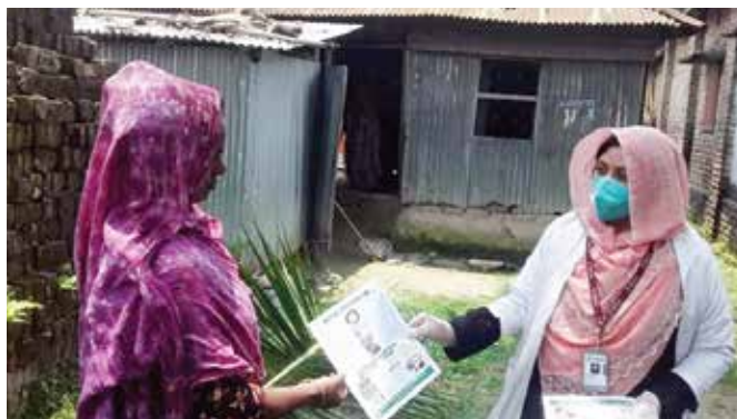
Awareness Building Campaign by THS