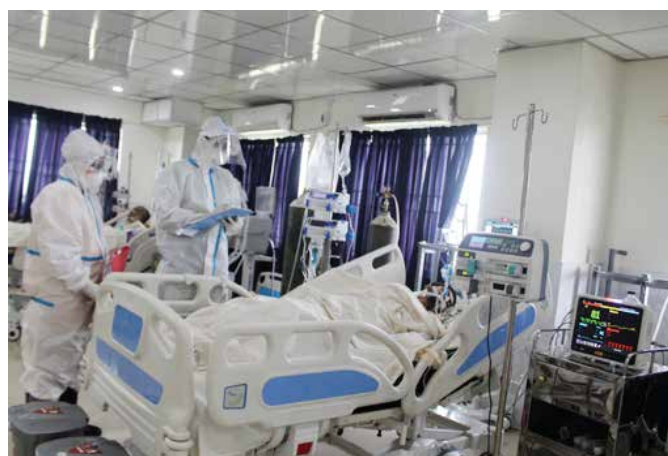
ICU of TMC&RCH