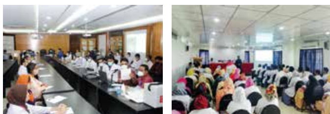
Providing training and motivational speech to TMSS front liner to fight against COVID-19

TGHS has established IT supported 4 institutional quarantine centers including 1 for own medical staff dedicated for Covid-19 management, Wi-Fi facility equipped 2 Covid-19 suspected ward (male-1 & female-1), 4 Covid-19 positive ward (male-2 & female-2) and 2 Covid-19 recovery ward (male-1 & female-1) including 10 Bed ICU with 2 ventilators in its TMC&RCH hospital, Bogura where 160 beds dedicated for Covid-19 patients.