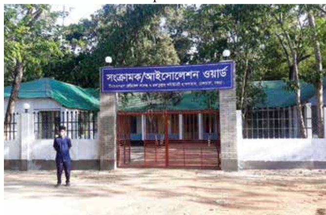
Part of Isolation Center under TMC&RCH

TGHS has established IT supported 4 institutional quarantine centers including 1 for own medical staff dedicated for Covid-19 management, Wi-Fi facility equipped 2 Covid-19 suspected ward (male-1 & female-1), 4 Covid-19 positive ward (male-2 & female-2) and 2 Covid-19 recovery ward (male-1 & female-1) including 10 Bed ICU with 2 ventilators in its TMC&RCH hospital, Bogura where 160 beds dedicated for Covid-19 patients.