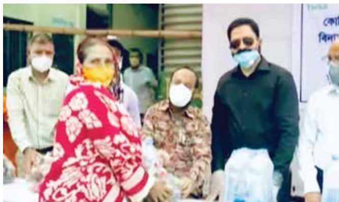
Distribution of drinking water and soft drinks