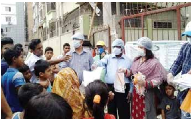
Awareness Building and Social Engagement of TMSS staffs during COVID-19 situation