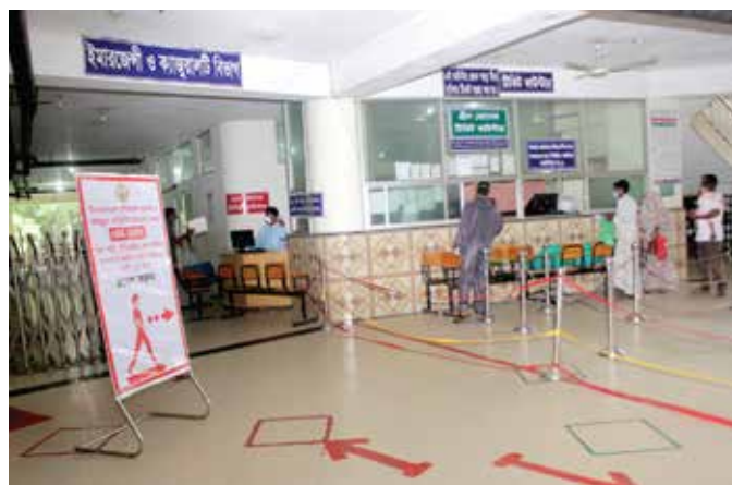
Covid & Non Covid Zone Demarcation (Red, Yellow & Green) at Hospital