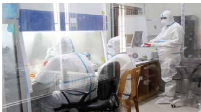
RT-PCR Lab of TMC&RCH

An integrated Triage System (physical, manpower, logistics, etc.) is in action at TMC & RCH hospital to ensure separate entry & exit, separate OPD for patients with fever, cough, sore throat etc. The hospital is also demarked as green, yellow and red zone as well as COVID and Non-COVID zone with hotline service to increase access to patients. However, the other services of TMC & RCH are open for 24/7 as usual.