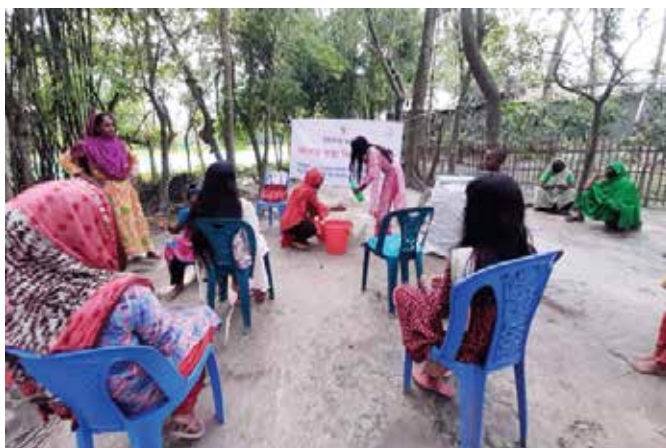
Awareness Building and Social Engagement of TMSS staffs during COVID-19 situation