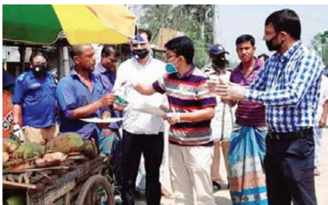
Mask and Leaflet Distribution