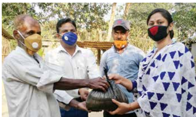
Relief distribution by TMSS Tengra branch