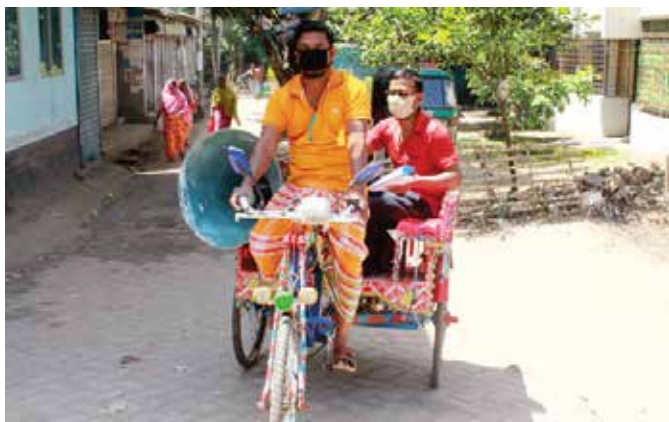
Awareness Building and Social Engagement of TMSS staffs during COVID-19 situation