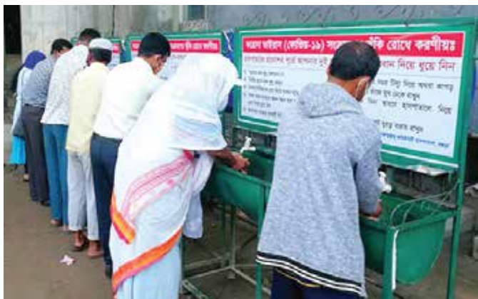
Hand washing arrangement for common people