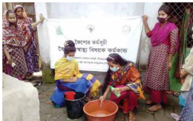
Adolescent club members are making Soapy Water

'Soapy water' is a UNICEF recognized low cost safe hand sanitizer. Members of the North 'Mahmudpur Adolescent Club' has made this sanitizer and distributed among the marginalized people in order to prevent COVID-19. TMSS HEM Sector is implementing 'Adolescent Club' project with the assistance of PKSF. In the Northern part of Bangladesh, 3134 adolescents are educating in their respective area's community people about COVID-19 through 105 adolescent clubs. To make this sanitizer 1.5 liters water, 4 tea spoons detergent and a bottle will be needed. After washing hands with soapy water, one should wash hands with clean water.