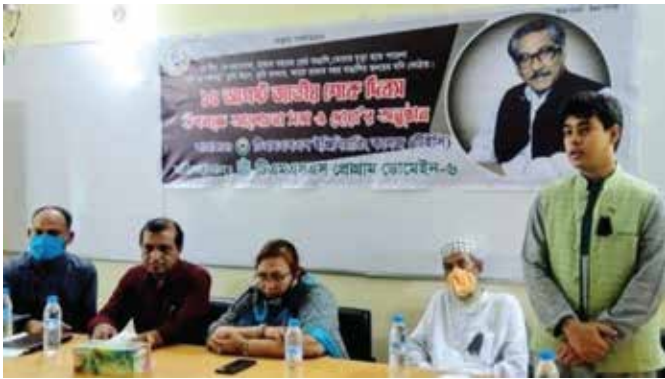
Discussion session on Bangabandhu's life at TMSS Engineering College (TEC)