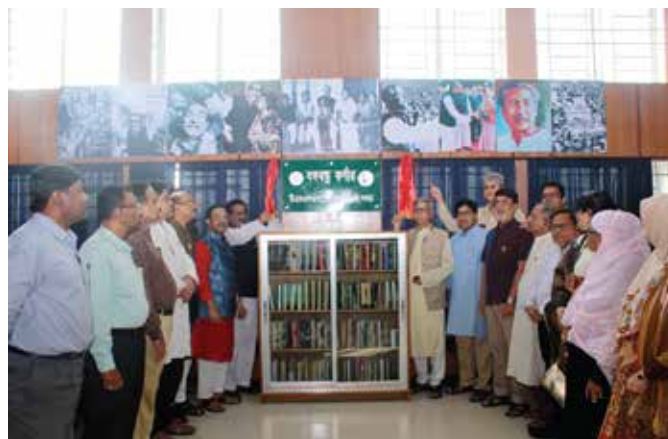
Inauguration of Bangabandhu Corner at TMC

Medical College at 9.15 a.m. At 9.40 am Bangabandhu Corner was inaugurated in the library of TMSS Medical