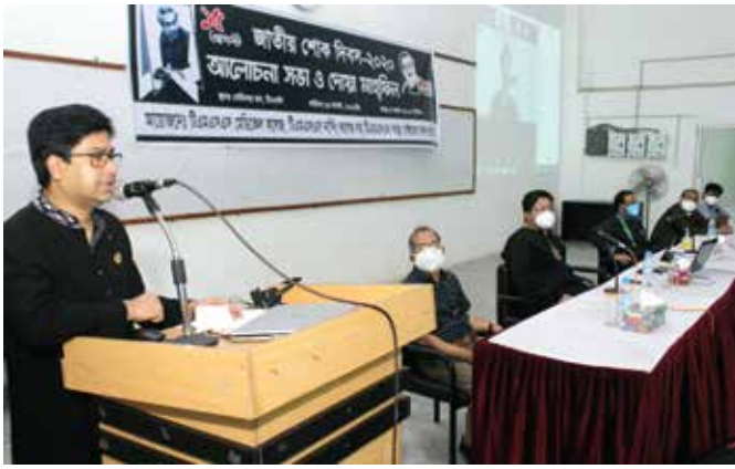
Discussion session organized by TMC on the National Mourning Day