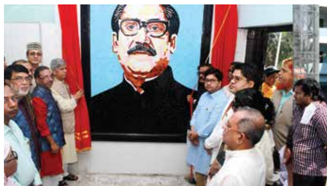
Unveiling the portrait of Bangabandhu Sheikh Mujibur Rahman at TMC