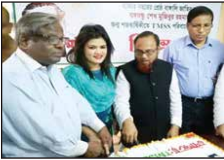
Bangabandhu's birth ceremony celebration at TMSS Head Office