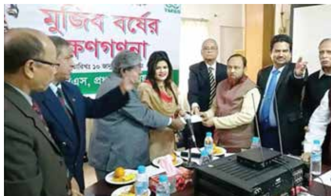
Cheque handover ceremony for higher education from TMSS Bangabandhu Scholarship Fund.

TMSS, a leading development organization in Bangladesh, is proud to offer 'Mujib Scholarship' in commemoration of the Birth Centenary of Bangabandhu Sheikh Mujibur Rahman. This Scholarship is awarded to the deserving students of all educational institutions of TMSS including TMSS Medical College.