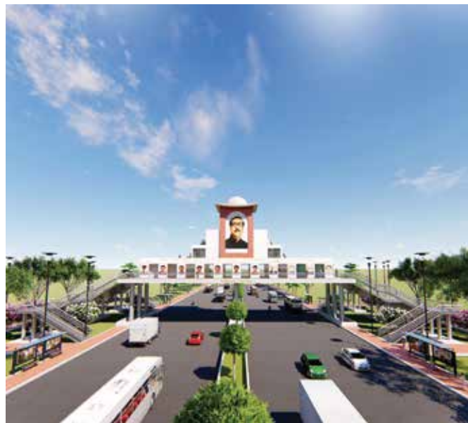
Proposed Bangabandhu Gate next to Pundro University, Bogura

Bangabandhu Gate' dedicated in the name of Father of the Nation Bangabandhu on the south of the Pundra University of Science & Technology which still carries the ancient civilization of Pundra City.