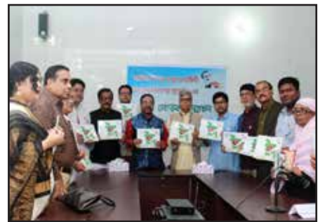
Souvenir unveiling at TMC