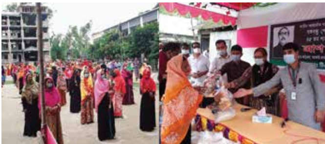
Relief distribution among distressed people on National Mourning Day

She addressed that huge amount of trees need to be planted to deal with the adverse effects of climate change as well as to save the country. She further added that all staffs of TMSS and 1.1 Million beneficiaries should encourage each others to plant trees on regular basis. Food and relief distribution program among the poor people was also resumed on the occasion of the Birth Centenary of Father of the Nation and hoping to continue throughout the Mujib Borsho to mitigate the urgent needs of disadvantaged people.