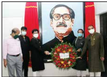
Wreath placing on the portrait of Father of the Nation Bangabandhu Sheikh Mujibur Rahman at TMC