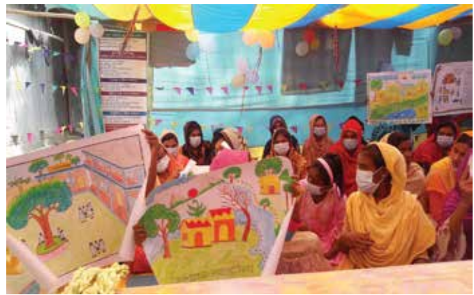
Drawing competition organized by Adolescent Club

Vegetable cultivation program to ensure food security, trees seedling distribution among Adolescent Club members and drawing competition were also conducted on the occasion of the Birth Centenary of Father of the Nation.