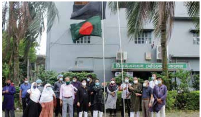
Flag hoisting session by TMC on National Mourning Day

On August 15, 2020, TMSS Grand Health Sector organized a day-long program on the occasion of the Martyrdom Anniversary of the great architect of independence Father of the Nation Bangabandhu Sheikh Mujibur Rahman, and National Mourning Day. Due to the Corona situation, all the programs were conducted in full compliance with the hygiene rules announced by the government. The program started at 8.00 am with the hoisting of the national flag at all the medical education