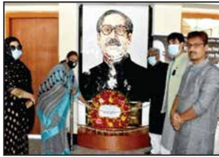
Wreath placing on the portrait of Father of the Nation Bangabandhu Sheikh Mujibur Rahman at TPSC