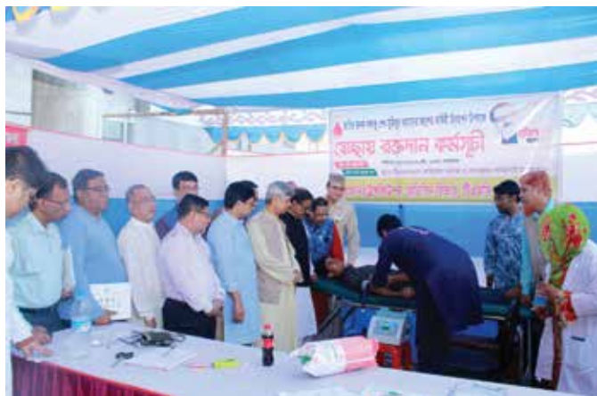
Voluntary blood donation activities at TMC

Speakers at the event said that there was a plan to organize a massive event on the occasion of Mujib Borsho, but it has to be done on a small scale due to the transmission of corona virus in the country. On this auspicious day, the beloved 'Khoka' of the Sheikh family was born in Tungipara who gradually became the 'Mujib Bhai' and 'Bangabandhu' of the Bengali. In protest-struggle, motivation he became the pride, guardian, father, leader of a nation. Like a father, he embraced the nation for freedom. Under his leadership the independence of the Bengali nation became a reality and Bangladesh was born. At the age of 55, some misguided soldiers took his life. 'Bangabandhu is not physically alive among us. But his ideals are our eternal source of inspiration. May his principles and ideals spread from generation to generation, may courageous, selfless and idealistic leadership be formed. The guests highlighted various important aspects of the life of Father of the Nation Bangabandhu Sheikh Mujibur Rahman. Besides, a day-long voluntary blood