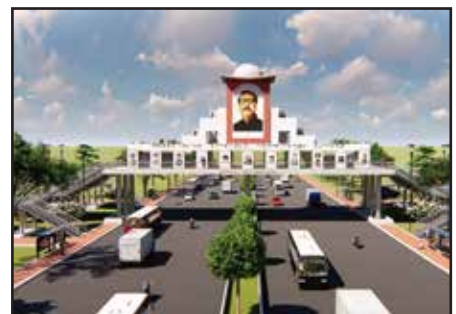
Proposed Bangabandhu Gate next to Pundro University