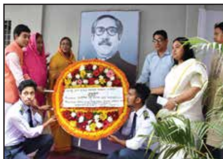
Wreath placing on the portrait of Father of the Nation Bangabandhu Sheikh Mujibur Rahman at TISI Campus