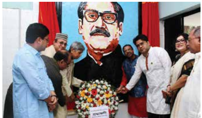
Wreath-placing on the portrait of Father of the Nation

institutes run by the TMSS health sector. After the wreath-laying on the portrait of Father of the Nation Bangabandhu Sheikh Mujibur Rahman, a discussion meeting and prayer session was held at TMSS Medical College Seminar Hall at 9.00 am.