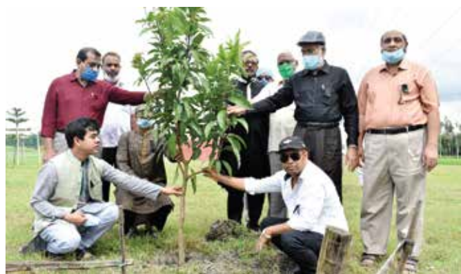
Tree plantation activities on the occasion of Mujib Year

TMSS greeted all concerned for making one crore tree plantation program possible across the country on the occasion of the birth centenary of the Father of the Nation Bangabandhu Sheikh Mujibur Rahman. The yearlong one