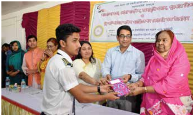
Students of TMSS Institute of Science and ICT (TISI) awarded by the guests

TMSS Institute of Science and ICT (TISI) Dahapara, Sujabad, Bogura inaugurates free computer course for students on its own campus on the occasion of the centenary of the birth of Father of the Nation Bangabandhu Sheikh Mujibur Rahman. Additional Deputy Commissioner (Education and ICT), Bogura