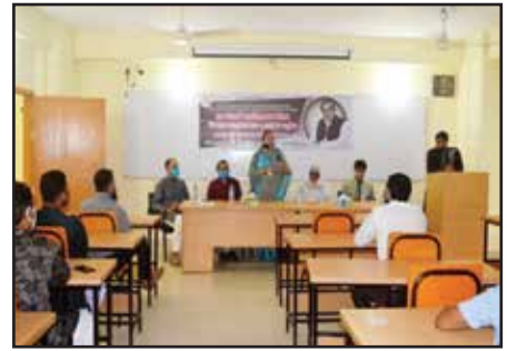
Discussion on Bangabandhu's life At TEC Campus