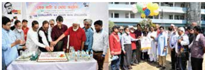
Celebration of the birth centenary of Bangabandhu at Pundra University