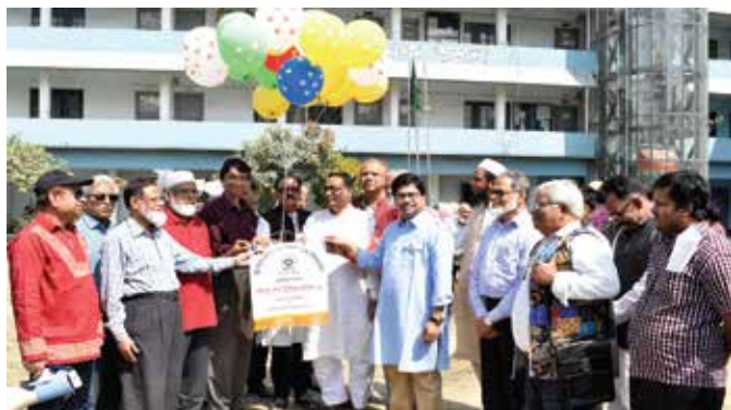
Inauguration of Birth Centenary of Bangabandhu at TMC