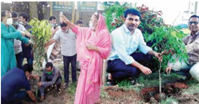
Tree plantation activities by TMSS HEM Sector