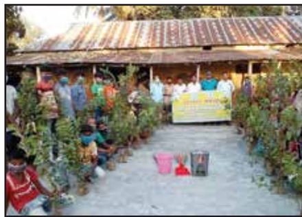
Tree seedling distribution among the Adolescent Club members