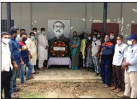
Wreath laying on the portrait of Father of the Nation Bangabandhu Sheikh Mujibur Rahman at TISI